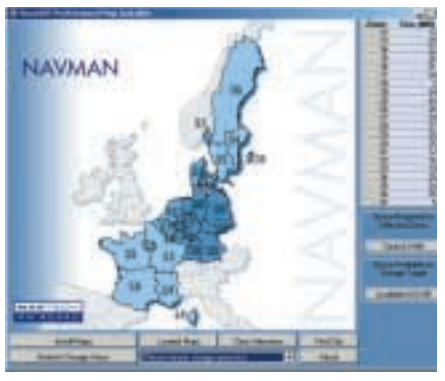
Map selection PC Graphical User Interface